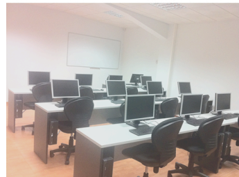
CENTRO DE FORMACIÓN UNTEL AULA DE FORMACIÓN Nº 6